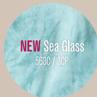
NEW Sea Glass 563C / 3CP