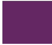
Wine 262C / 43P