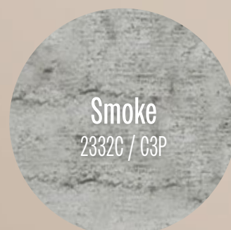
Smoke 2332C / C3P

DISCLAIMER Color Blast™ is a pigment dye technique that yields a unique color and Color Blast™ effect in every garment. We do not guarantee consistency amongst individual garments.