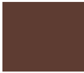
Espresso 7596C / 09P