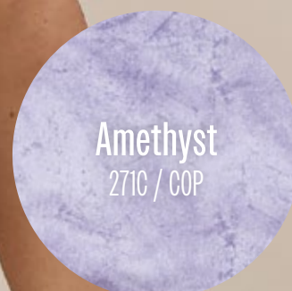
Amethyst 271C / C0P