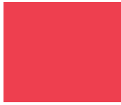
Watermelon 1787C / 41P