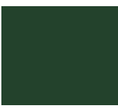
Sage 5743C / 18D