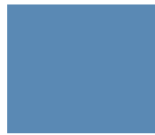
Washed Denim 7682C / 22D