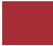
Brick 1956C / 05P