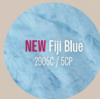
NEW Fiji Blue 2905C / 5CP