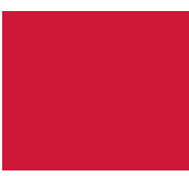
Paprika 2066C / 12R