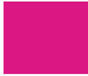
Neon Pink 212C / 32P