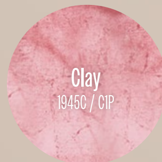
Clay 1945C / C1P