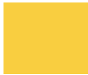
Citrus 149C / 11P