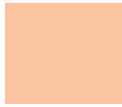
NEW Neon Cantaloupe 932C / 1CP