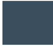
Denim 7545C / 14P