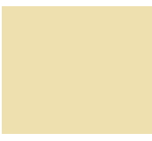
Banana 7496C / 01D