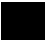
Black 426C / 01R