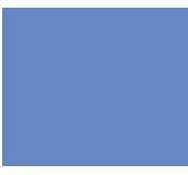
Mystic Blue 2718C / 15D