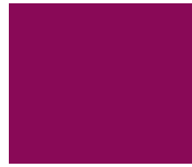
Berry 2056C / 02P