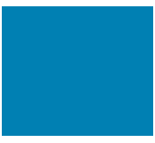
Sapphire 7461C / 16R