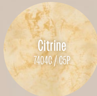
Citrine 7404C / C5P