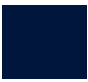
True Navy 2826C / 18R