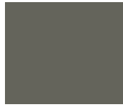
Grey 2333C / 19P