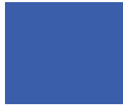
Periwinkle 2726C / 35P