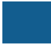
Blue Jean 2138C / 03P