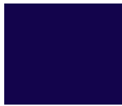
Grape 274C / 17P