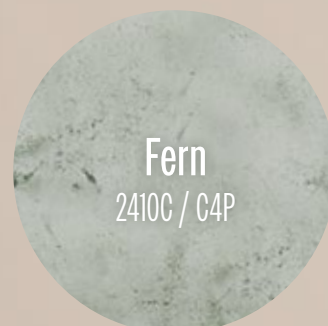
Fern 2410C / C4P