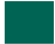
Emerald 329C / 15P