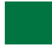
Grass 2244C / 18P