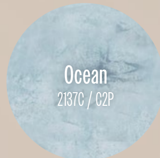
Ocean 2137C / C2P