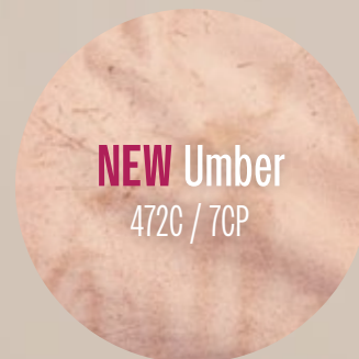
NEW Umber 472C / 7CP