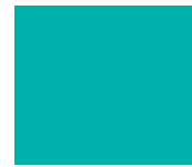
Seafoam 7475C / 38P