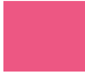
Crunchberry 1916C / 13P