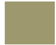
Khaki 2325C / 22P