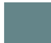
◆ Arctic ▲ 2178C / 8J2