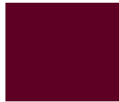
Cranberry ▲ 188C / 889