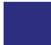
Lapis ■ 2756C / 818