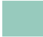
Celadon ■ 338C / 32S