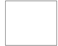
White ■ 000C / 00S / Z00