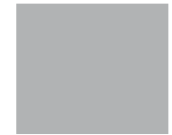
New Silver ★ CG4C / 835