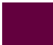
Heather Red ■ 193C / 07S