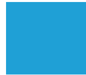
Teal ■ 2393C / Z72