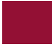
Cardinal ▲ 201C / 22S