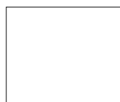
Sueded White ■ 000C / 1M5