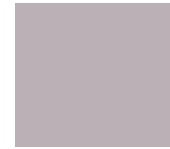
Ash Grey ■ 435C / 01S / 17Z