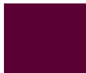
Burgundy ▲ 209C / 23S