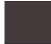
Brown ★ 411C / 874