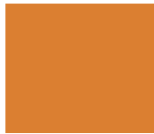
Orange ▲ 1585C / 95S