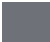
Heather Charcoal ▲ 425C / 08S