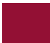
Cardinal ▲ 201C / 22S