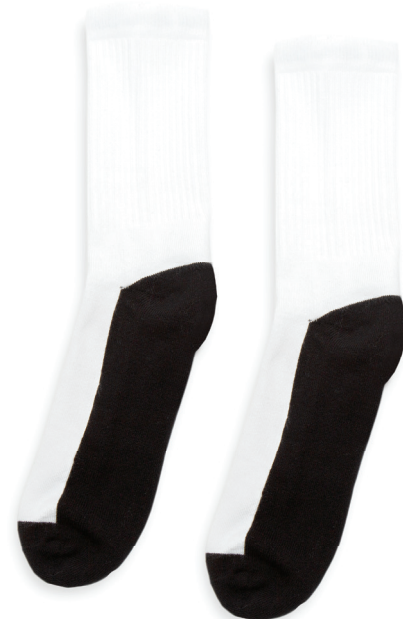
DYE SUBLIMATION SOCKS